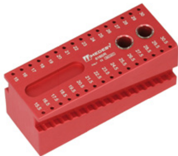
6160/R mm 100 x 40 x 40 Red / Rosso