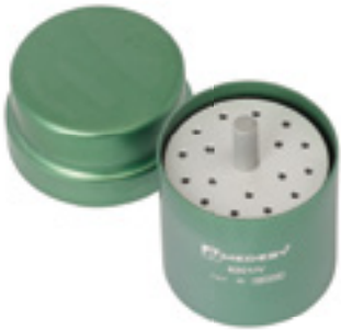
6201/V Green / Verde