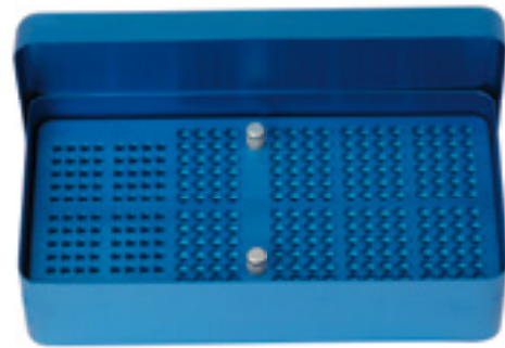
986 Blue Blu