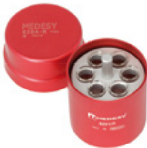
6204/R Red / Rosso