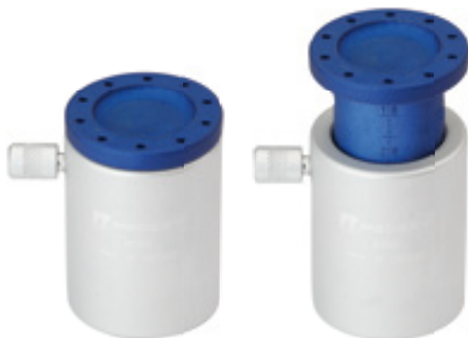
6150 ø mm 34 – h mm 48 Silver-Blue / Argento-Blu

MISURATORE PER STRUMENTI CANALARI, ALLUMINIO