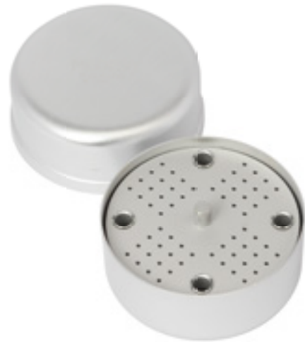
6200 Silver / Argento