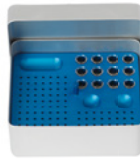
990 Silver-Blue Argento-Blu