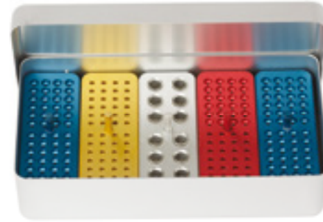
988 Silver + 3 colors Argento + 3 colori