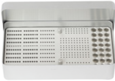
985 Silver Argento