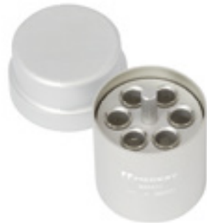
6204/G Silver / Argento