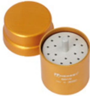
6201/D Yellow / Giallo