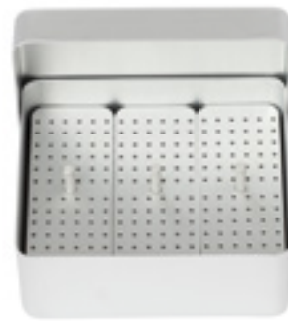
989 Silver Argento